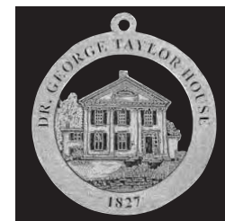
1995 Dr. George Taylor House