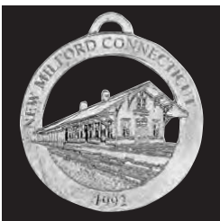
1992 Railroad Station