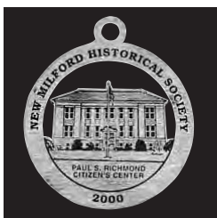
2000 Paul Richmond Center