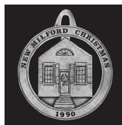
1990 First Bank Building