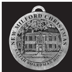
1993 Elijah Boardman House