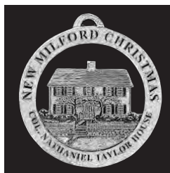
1994 Col. Nathaniel Taylor House