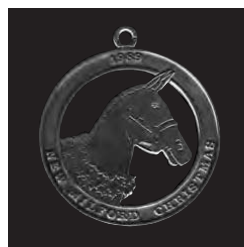
1989 New Milford Christmas