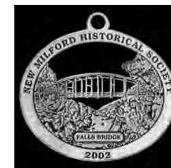
2002 Lover's Leap Bridge