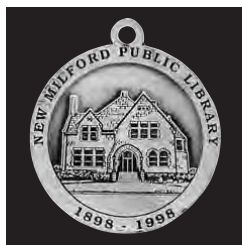
1998 New Milford Public Library