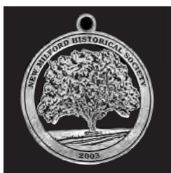
2003 George Washington Oak Tree