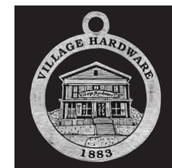
1999 Village Hardware