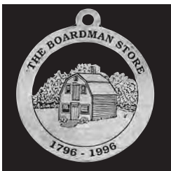
1996 The Boardman Store