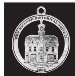
2004 Water Witch House No. 2