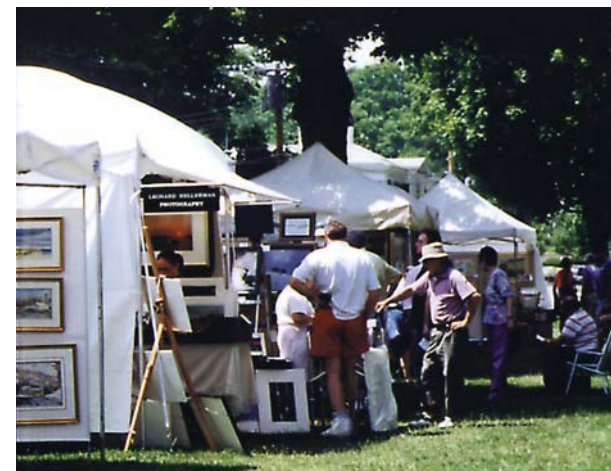
The New Milford Outdoor Art Festival